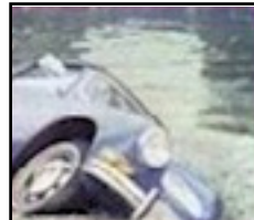
Emergency Notifications to CARE subscribers and others (Pro-CARE series)

Pro-CARE functions and system specifications 1 to 4 Analog Lines Prepared for: