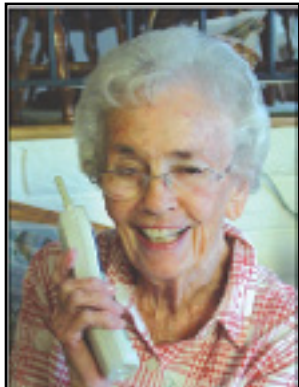
Daily Well Being Checks